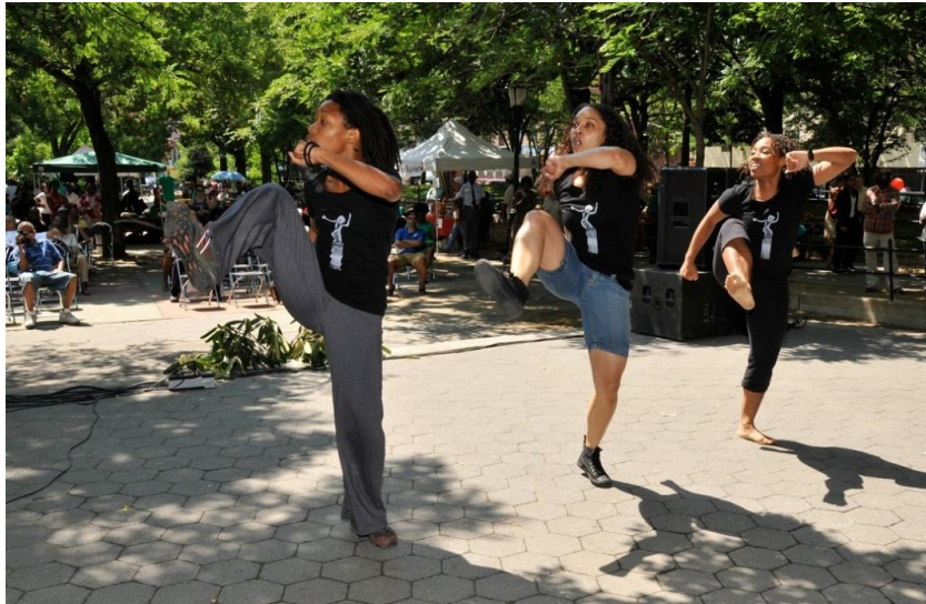
Urban Bush Women at Brooklyn Juneteenth, 2010.