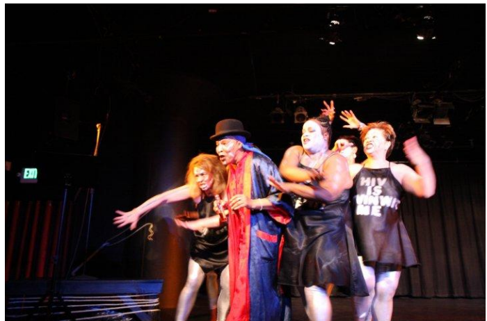
The Medea Project in Dancing with the Clown of Love.