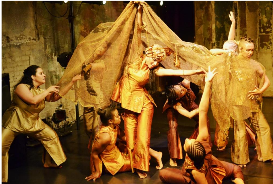
Tushaanal by Ananya Dance Theatre Company.

Last fall, a group of women of color took on the global oil industry—not through petitions or protests, but through the power of movement. In September 2012, Ananya Dance Theatre performed the U.S. premiere of Moreechika: Season of Mirage , an evening-length piece about the environmental, cultural, and human costs of oil extraction around the world, particularly on women of color. It is the