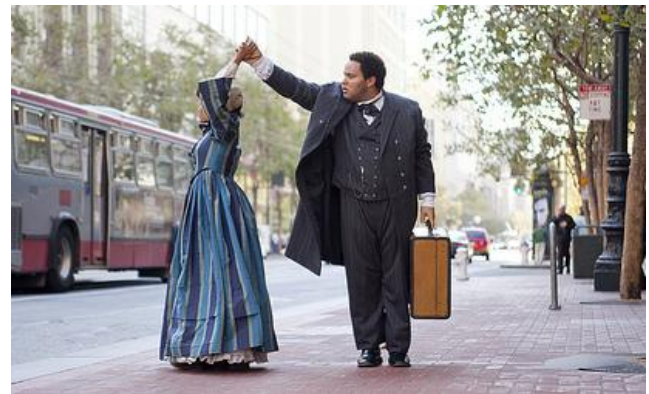
Sailing Away , presented by Joanna Haigood's Zaccho Dance Theatre.